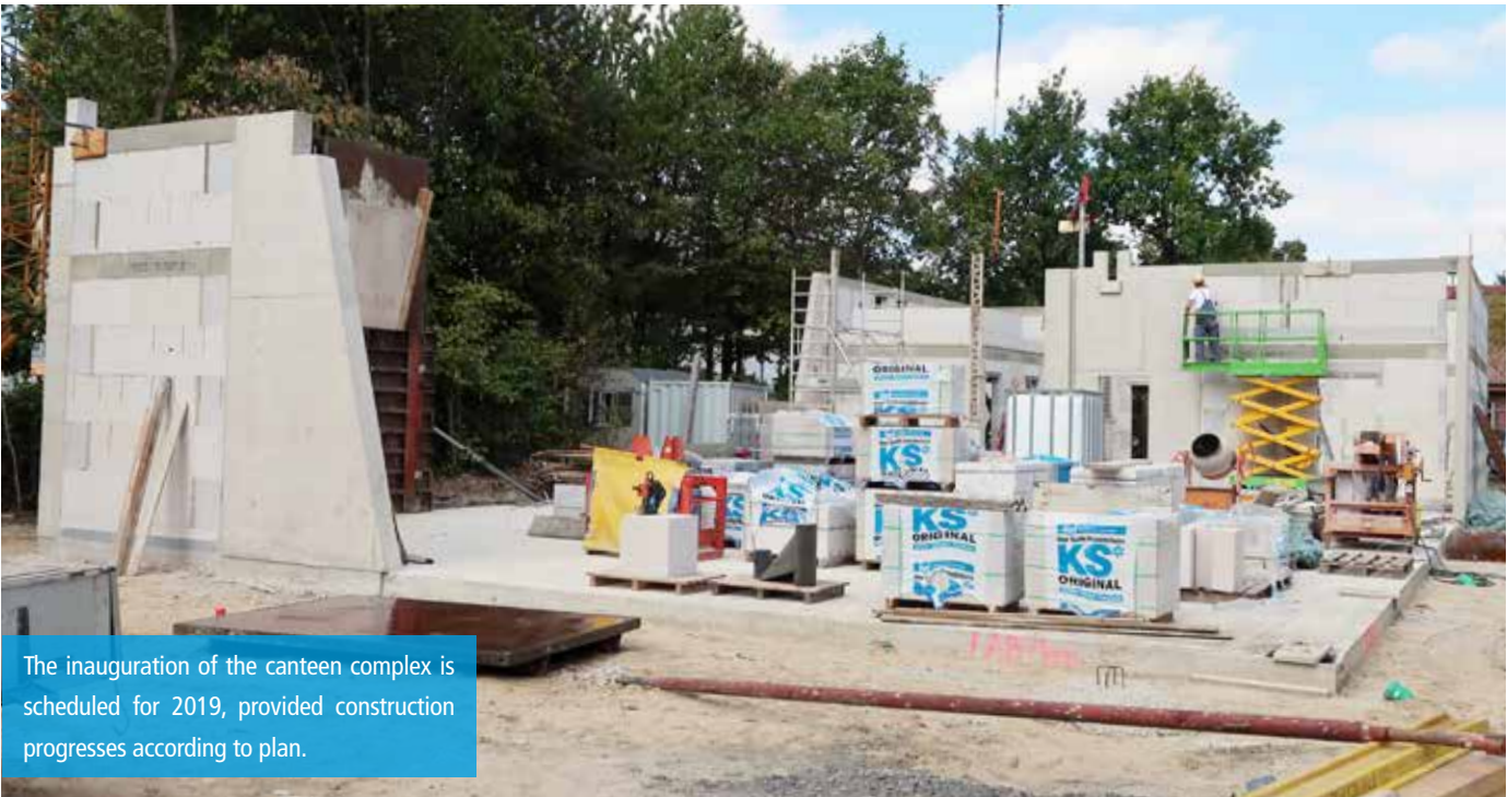
The inauguration of the canteen complex is scheduled for 2019, provided construction progresses according to plan.