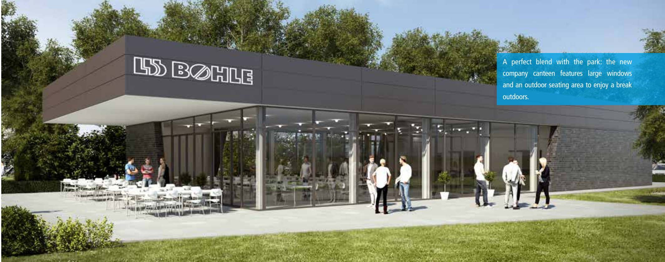
A perfect blend with the park: the new company canteen features large windows and an outdoor seating area to enjoy a break outdoors.