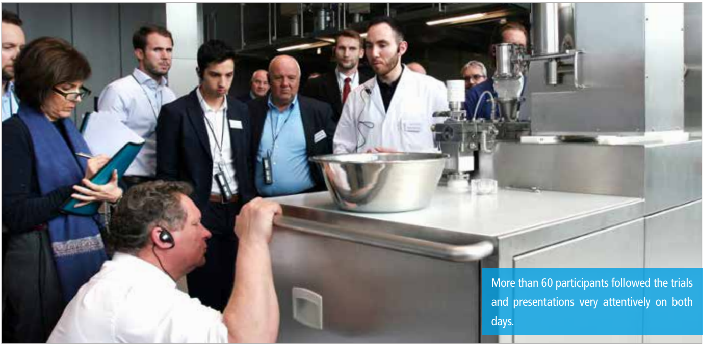
More than 60 participants followed the trials and presentations very attentively on both days.