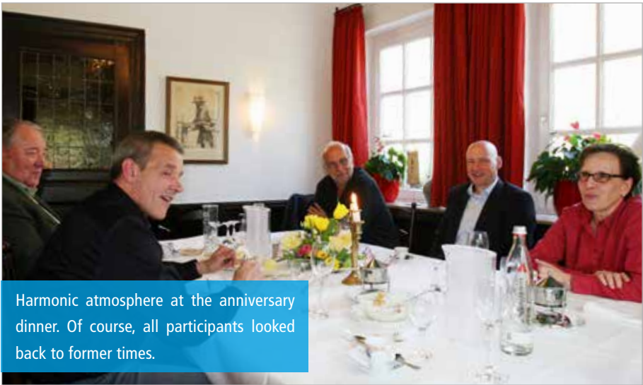
Harmonic atmosphere at the anniversary dinner. Of course, all participants looked back to former times.