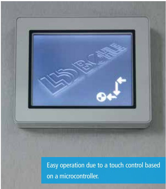
Easy operation due to a touch control based on a microcontroller.

gration of containment valves, drum adaptors or other devices. Operation via a remote touch panel enables operation outside the danger zone. Of course, the HS SL also offers a wide range of options, such as a load handling device, which can be implemented at the customer's request.