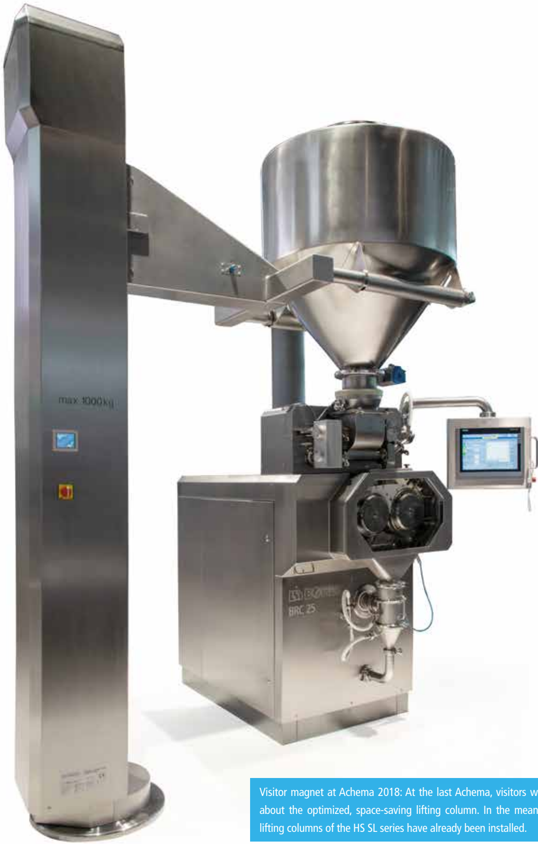
Visitor magnet at Achema 2018: At the last Achema, visitors were informed about the optimized, space-saving lifting column. In the meantime, several lifting columns of the HS SL series have already been installed.