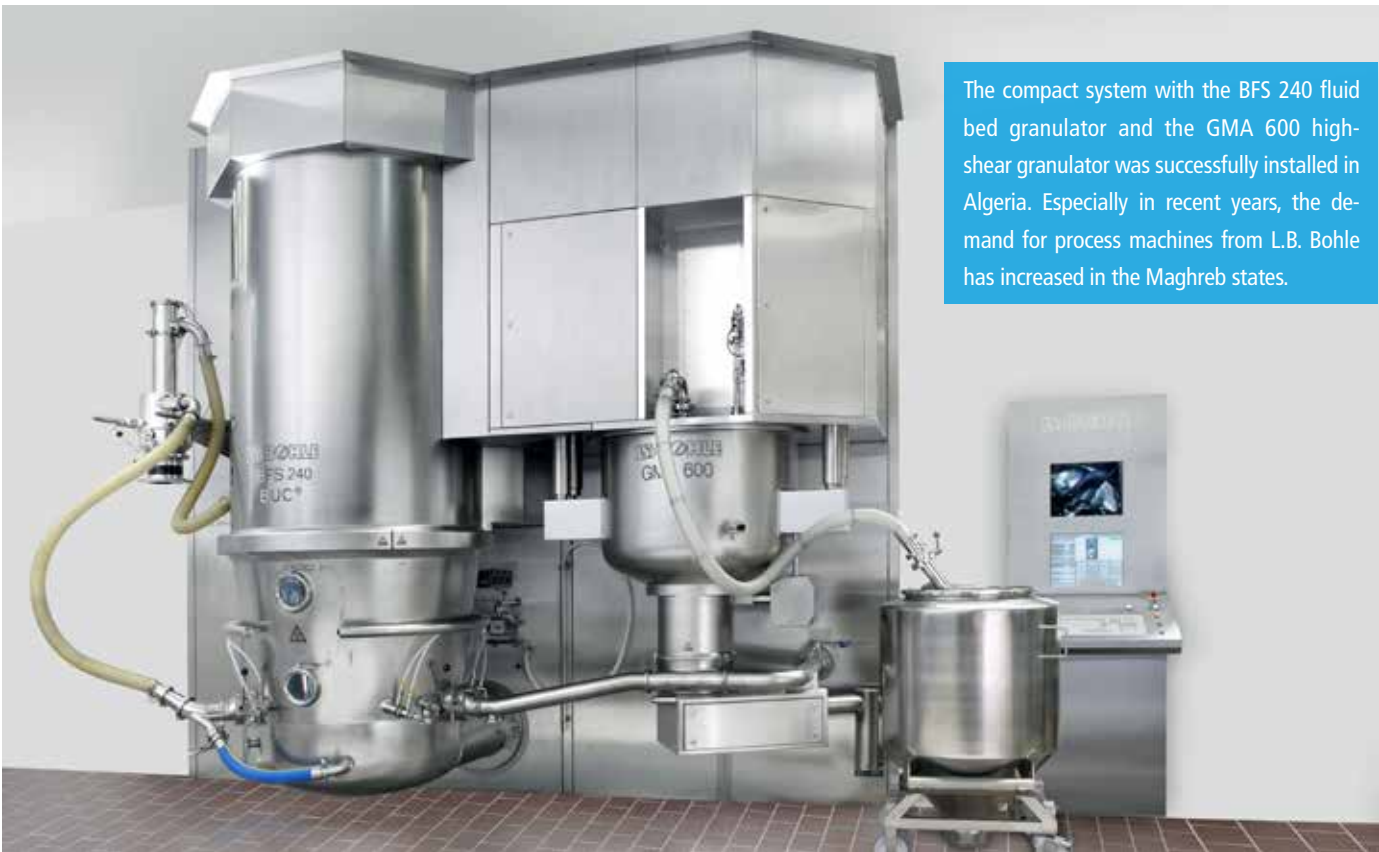
The compact system with the BFS 240 fluid bed granulator and the GMA 600 high-shear granulator was successfully installed in Algeria. Especially in recent years, the demand for process machines from L.B. Bohle has increased in the Maghreb states.