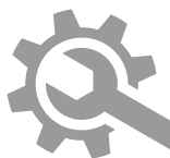
Low-Maintenance Chain Drive