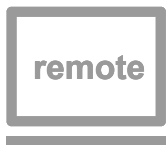
Remote Touch Control